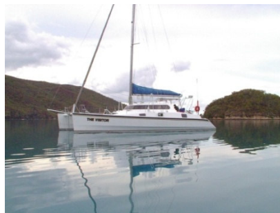
SY THE VISITOR