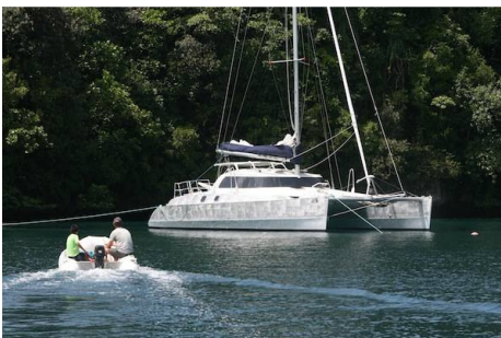
SY TWIN DAGGERS