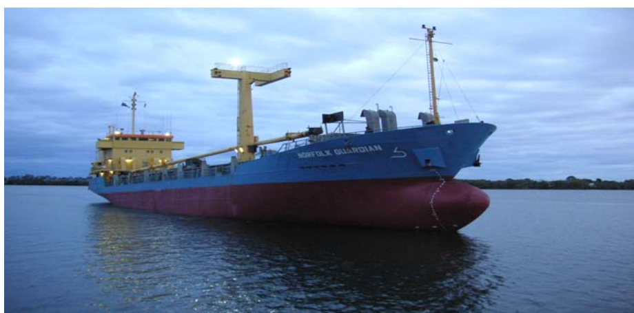
MV Norfolk Guardian

Harwood Slipway has associations with Lord Howe Island Shipping Services Pty Ltd can arrange shipping on board their cargo vessels MV Norfolk Guardian 2400 DWT & MV Sitka 400DWT based, Nuku’Alofa, Tonga.