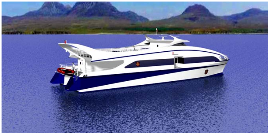
Harwood Marine Design 35m Aluminium Catamaran Offshore Support & Crew Transfer

162 -164 River Road, Harwood Island (PO Box 96) NSW 2465 Tel: 02 6646 4222 Fax: 02 6646 4472 Email: sales@harwoodslipway.com.au Website: www.harwoodslipway.com.au