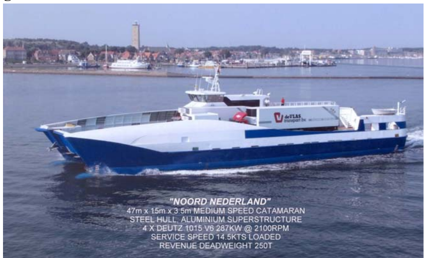
47m 'Noord Nederland' Roro ferry

"NOORD NEDERLAND" 47m x 15m x 3.5m MEDIUM SPEED CATAMARAN STEEL HULL, ALUMINIUM SUPERSTRUCTURE 4 X DEUTZ 1015 V6 287KW @ 2100RPM SERVICE SPEED 14.5KTS LOADED REVENUE DEADWEIGHT 250T