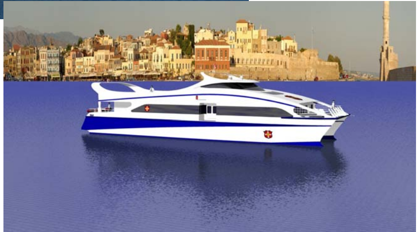
35m Aluminium Catamaran