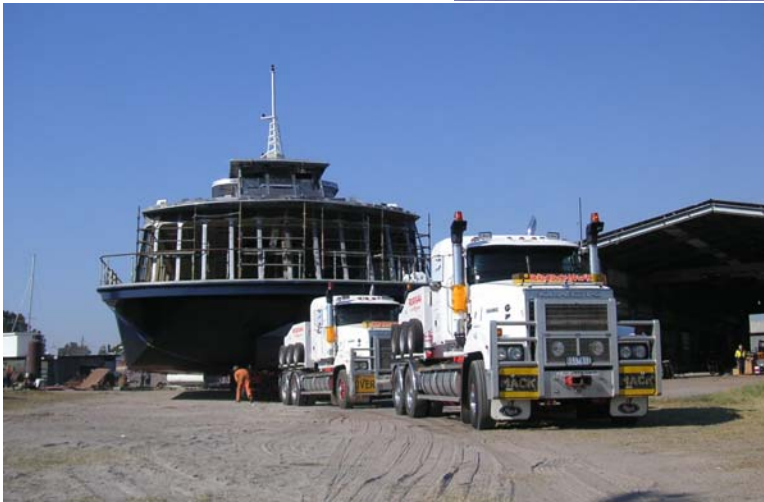
40m Bella Vista Cruising Restaurant