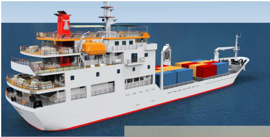
76m Tuhaa Pae IV Under construction